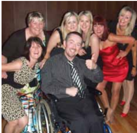
Enjoying the Summer Ball, May 2011

The Wexford Service is based in the village of Ballymurn. It started 4 years ago in late 2007, with the opening of the Residential Rehabilitation Service and then grew in 2008 to include a Home and Community Rehabilitation service. Since that time it has gone from strength to strength.