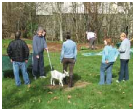
No kidding its a great service!

There are now five people living in Ballymurn. Our focus is on empowerment and individual rehabilitation and therefore when one person wanted chickens, we adopted six chickens. The next request was for goats so we approached Bothár and are now fostering two female goats that will be leaving us for Africa in December. Where our growing farm will end? We just don't know!