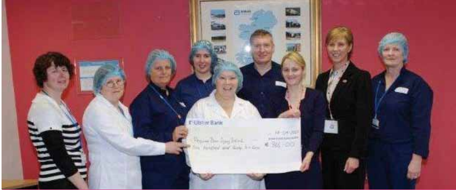
Presenting a Golden Cheque Abbott Ireland Team Croí an Óir, & ABI Ireland, Sligo