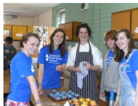
Transition Year Students Colaiste Iognaid.